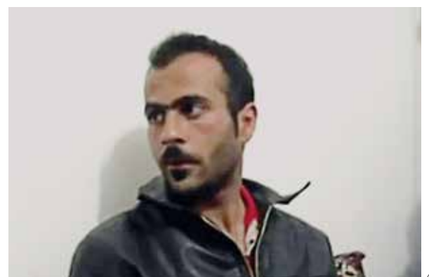
1 Syrian shabbiha