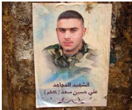
Naame Shaam's correspondent in Beirut toured several predominately Shia districts in the Lebanese capital. In one area, Amiliyeh school, he saw posters of one Amal and three Hezbollah 'martyrs' who had died in Syria. Local residents confirmed this..