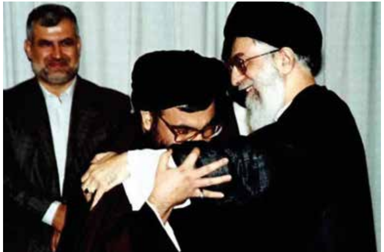
Hezbollah Lebanon chief, Hassan Nasrallah kissing Iranian Spiritual Leader Ayatollah Ali Khamenei in Iran (undated photo).

There have been numerous reports about such crimes committed by Syrian regime forces and militias by various Syrian and international bodies and organisations. Unfortunately, most of these reports often stop short of pointing the finger at everyone responsible for these crimes. As many examples cited in this chapter should have demonstrated, many of these crimes would not have taken place without the Iranian regime's direct mili-