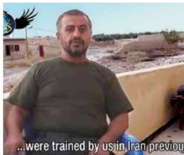
The commander-in-chief of Sepah Qods, Gen. Qassem Soleimani, who is the de facto ruler of Syria.