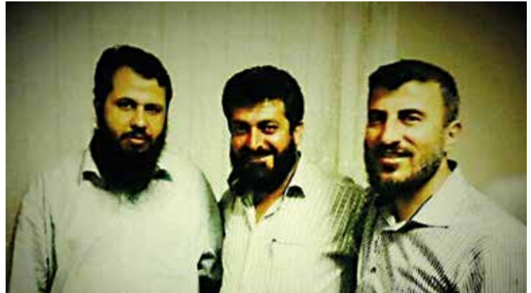
1 Afghan fighters in Syria (date unknown).