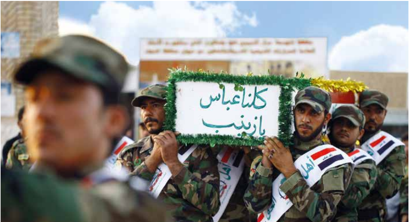
Iraqi Shia militiamen in Baghdad preparing to depart for Syria, June 2013 (Newscom). Source: http://www.weeklystandard.com/articles/iraq-war-not-over_736876.html

weapons and equipment for Jaysh al-Sha’bi. Iran has also provided routine funding worth millions of dollars to the militia.” 53