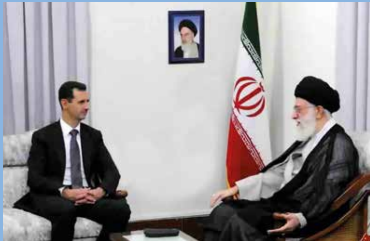
Syrian President, Bashar al-Assad, and Iranian Spiritual Leader, Ayatollah Ali Khamenei, in 2010. Ayatollah Ali Khamenei in Iran in 2010.